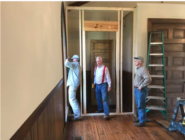
Closet doors in Trinity Hall