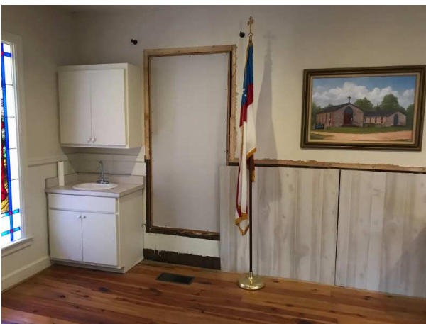
Closed in Window behind the coming Coffee Bar